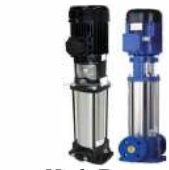
High Pressure Pump CRI/Gorounfors/Lubi