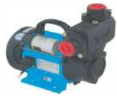
Row Water Pump Lubi, Sarvo, CRI