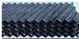
Tube Settler Media