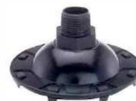
Air Diffuser Disk